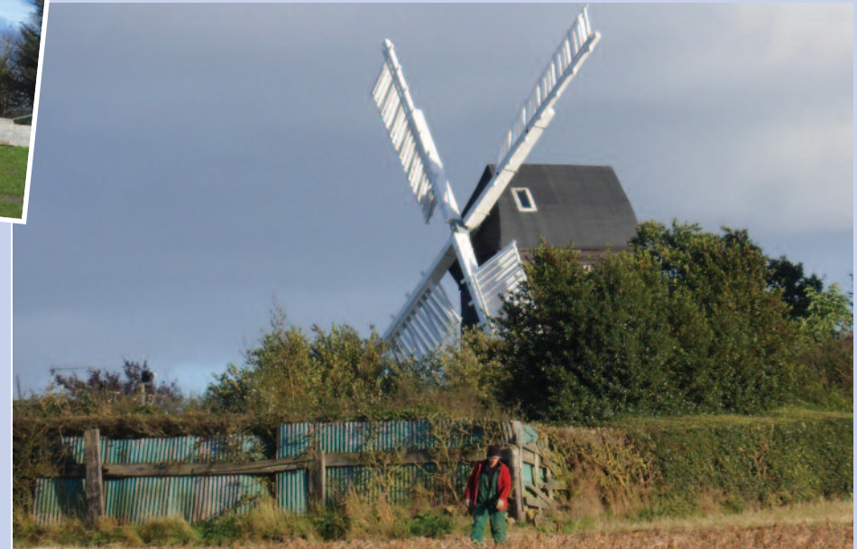
Below: The Cat and Fiddle windmill, the only surviving post mill in Derbyshire.