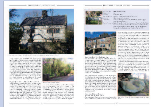
Example of a double-page spread.