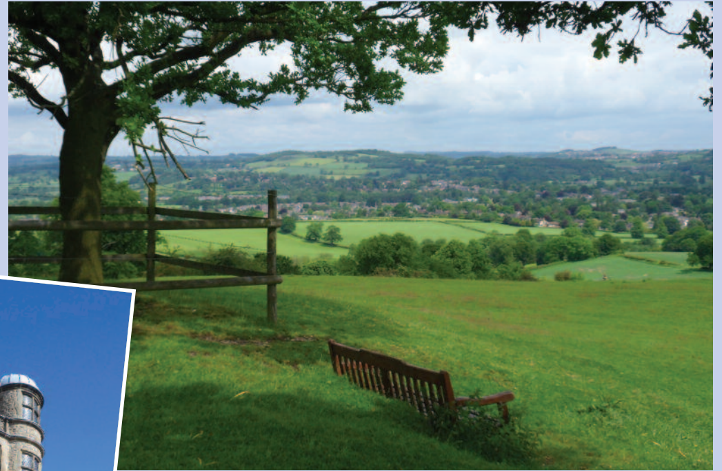
Above: View to the north-east from Bunkers Hill.