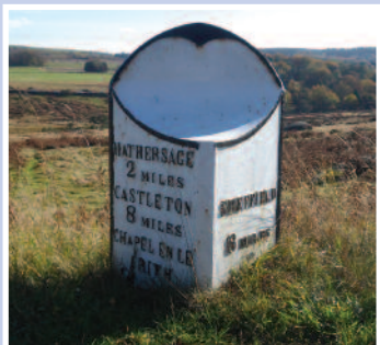
Cast-iron mile-marker on what is today known as the A6187 between Sheffield and Manchester but which was turnpiked in the 1750s.